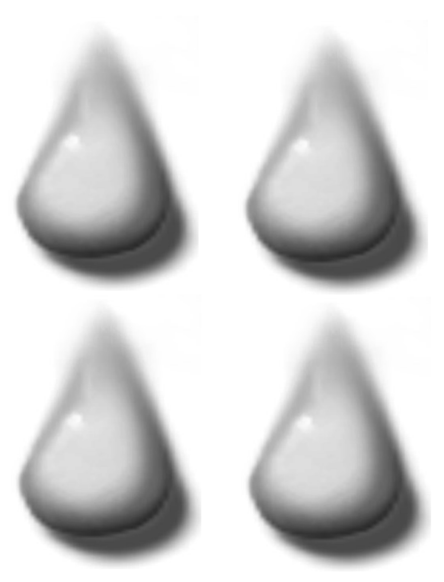
Fountain Water Drops