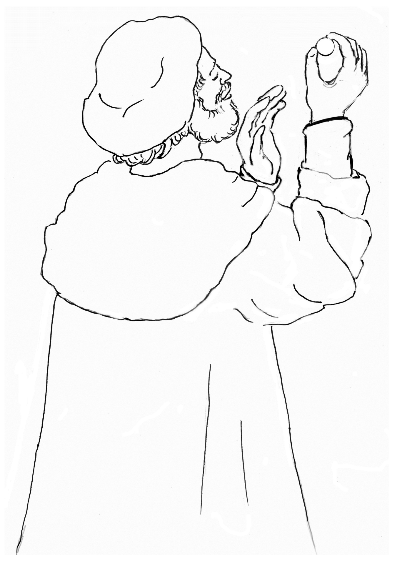
Pearl of Great Price