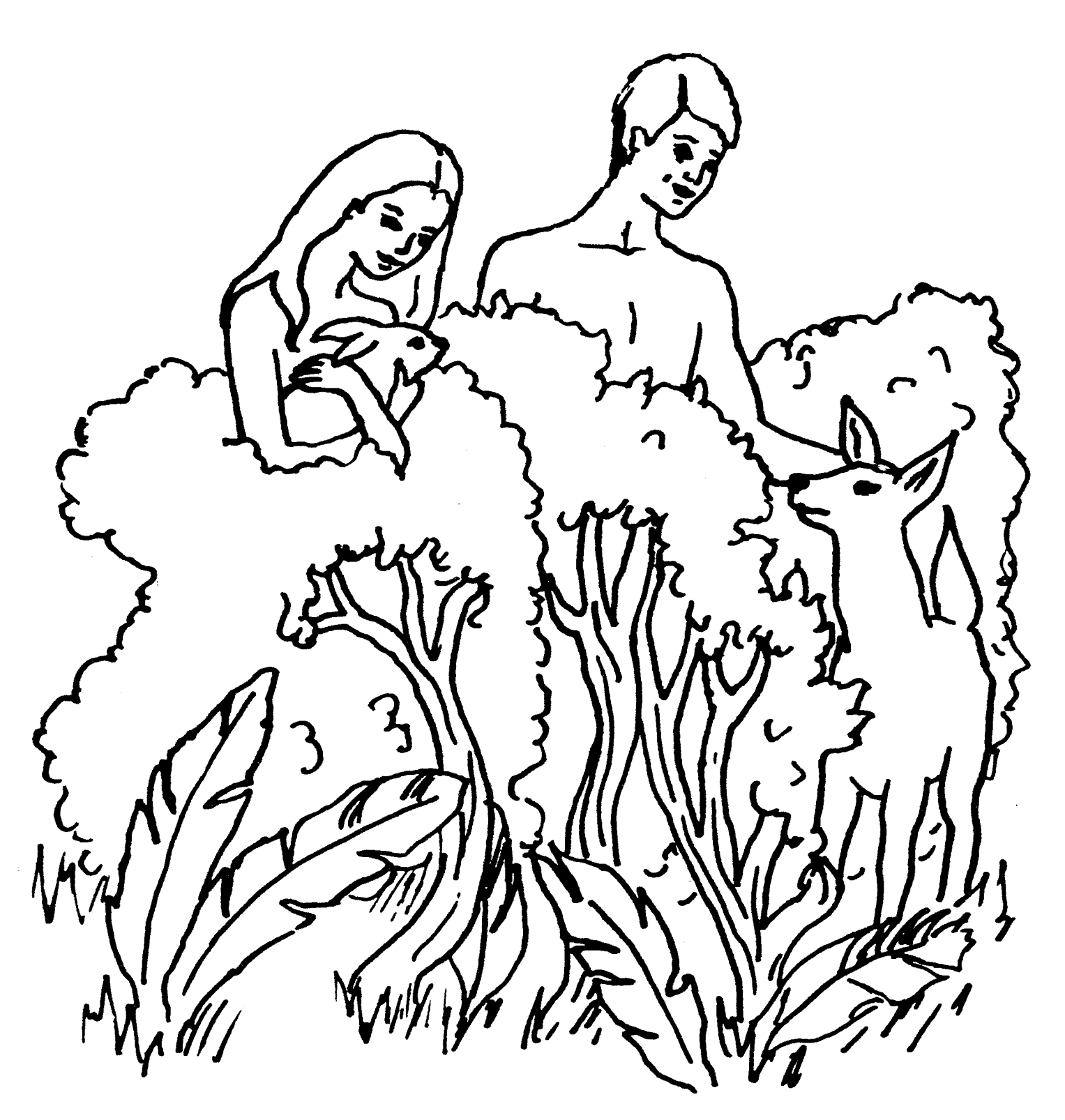
The Sixth Day of Creation