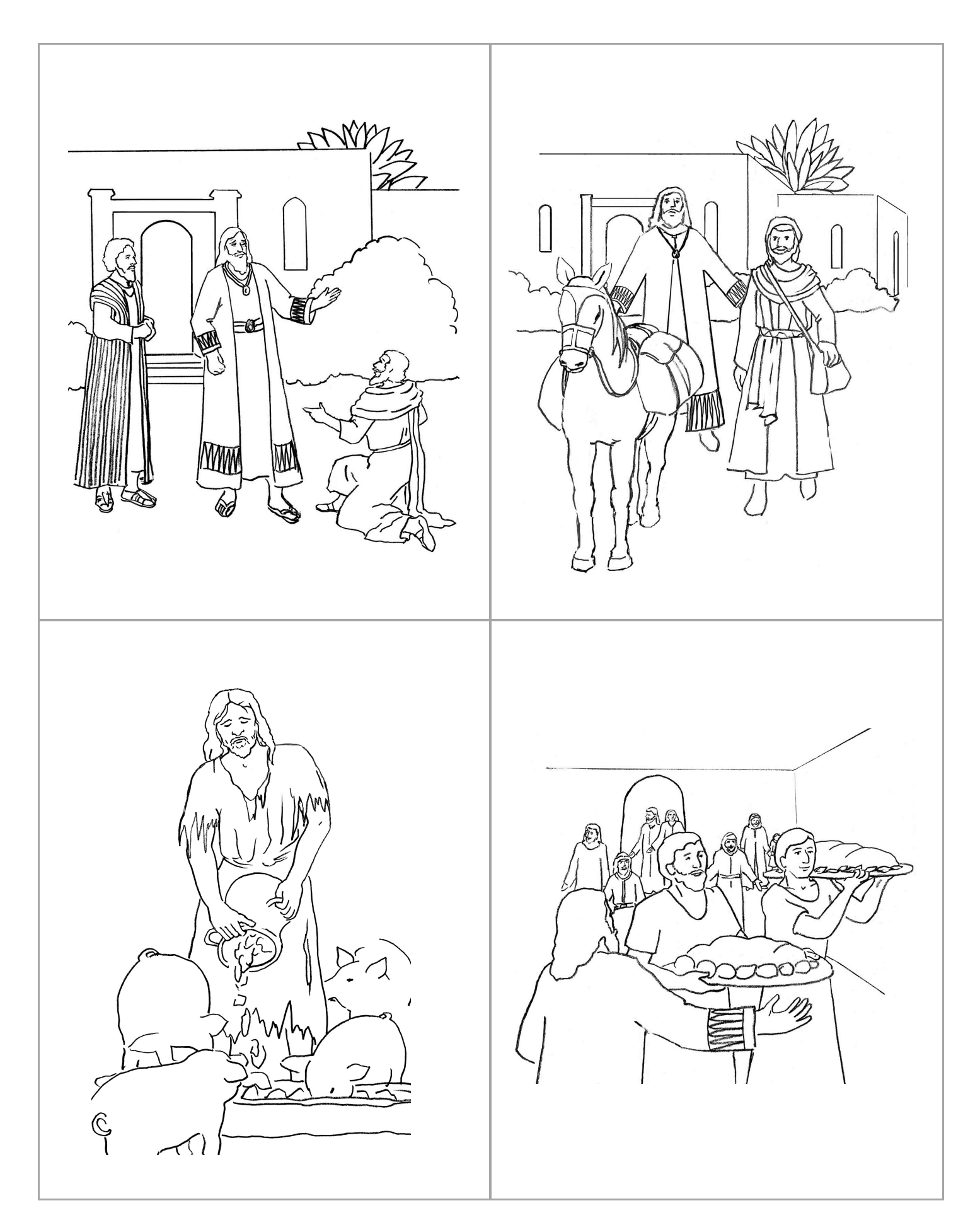
Parable Pictures B