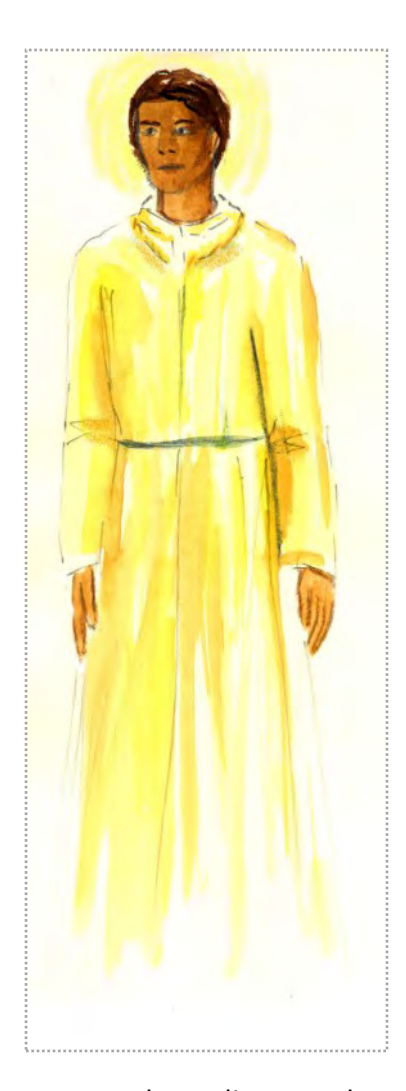
Angel standing guard at the gate