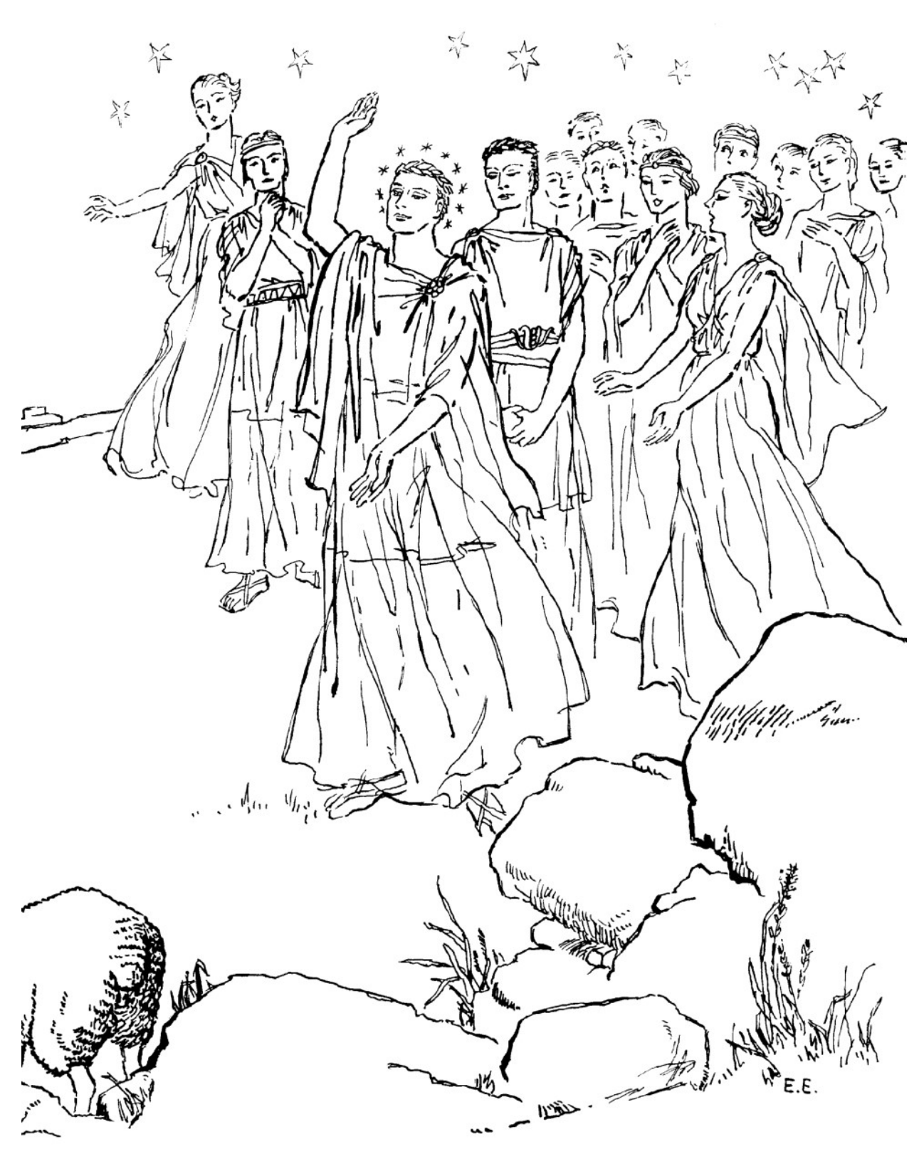
Glory of the Lord