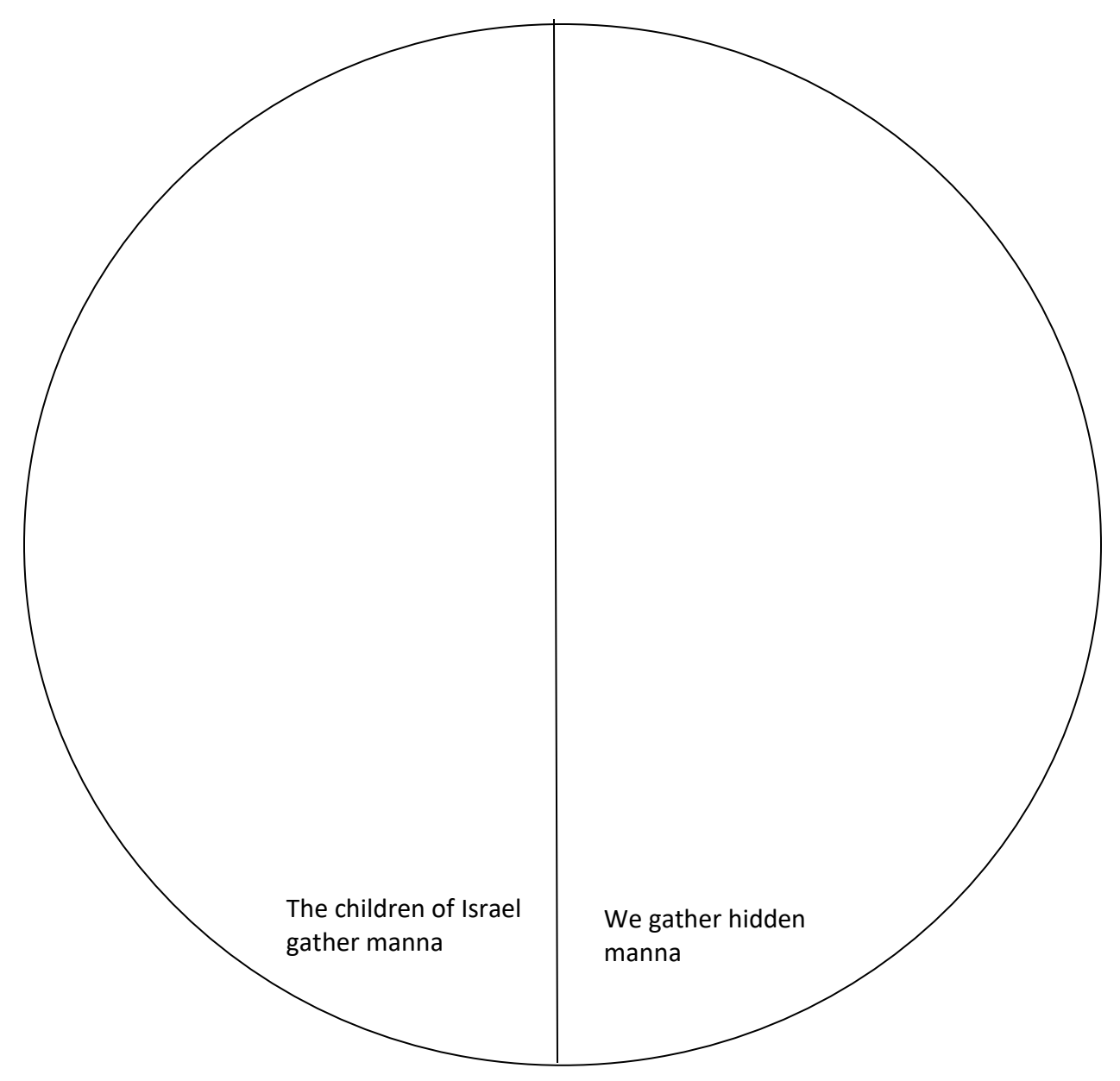
Strips for writing true ideas from the Word.