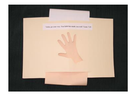
shows healthy hand

1 piece of stiff paper/lightweight cardboard (manila folder works fine) 1 piece of white paper 1 piece of flesh-colored paper scissors tape and/or glue