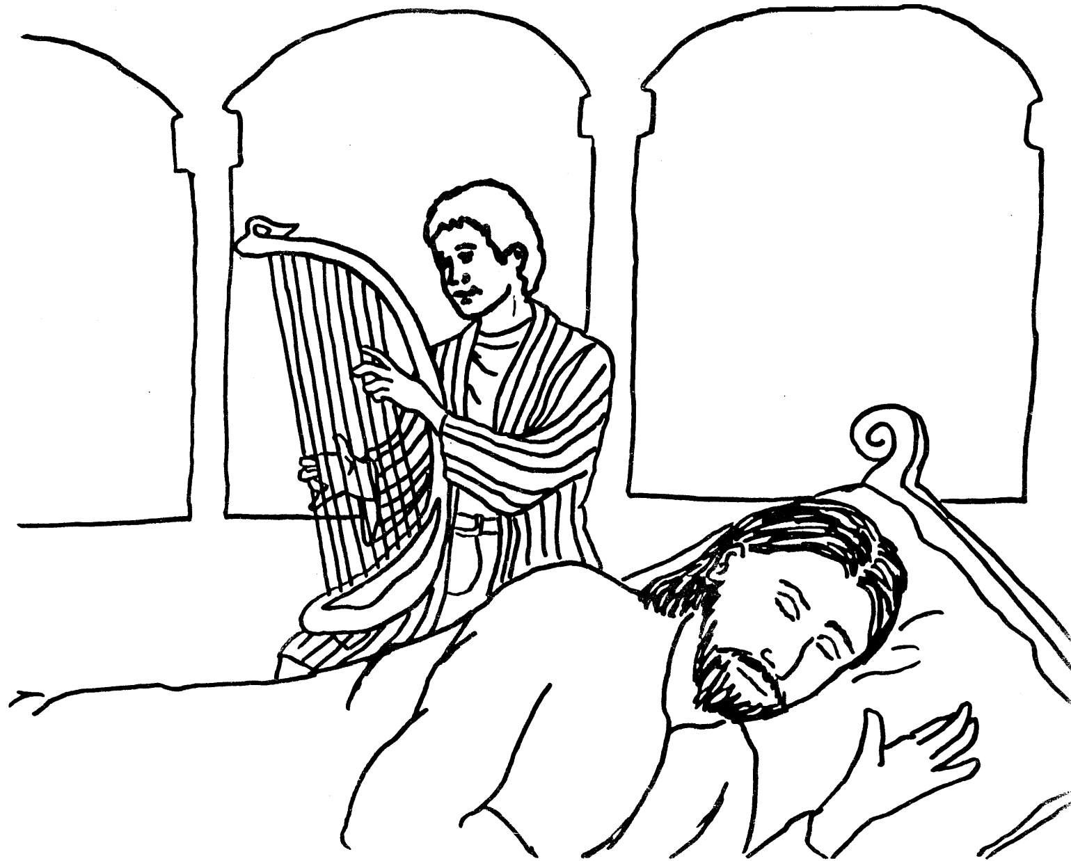
David plays the harp for Saul.