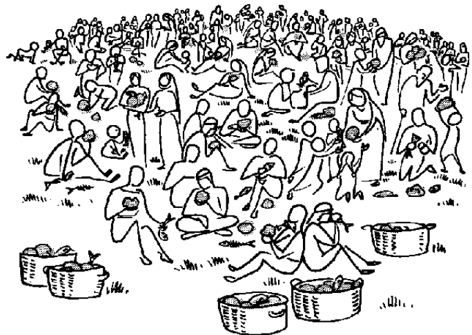
They all ate and had enough (Lk.9.17)

6. Put a little glue on a small piece of scrap paper. Dip the pieces of “bread” or “fish” lightly in the glue and paste them in the baskets, heaping and overlapping the pieces to show how much there was left over.